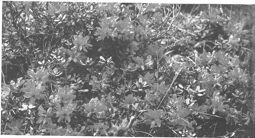
Plate 2: སུལ་ sulu , Rhodendron setosum