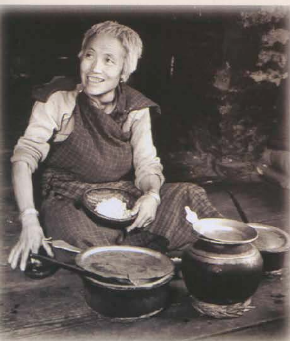
A 'Ngalop woman cooking at Neptengkha, a native speaker of Dzongkha in western Bhutan

The nooks and crannies of the Himalayas are full of beautiful landscapes and lovely people, but they are also full of real surprises. Until the 1990s, both Gongduk and the Black Mountain language in central Bhutan remained totally unknown to science and to the outside world. Needless to say, the people in these language communities themselves, and their immediate neighbours, knew about their own existence. Yet even these people had no idea of how special their languages are in the context of Himalayan and Asian prehistory. Other truly special languages, such as the Lhokpu language of southwestern Bhutan, remained totally uninvestigated until they were first studied and documented by our research programme.