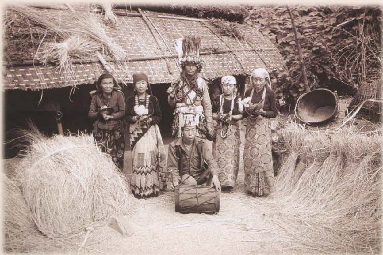
A Dumi shaman with an entourage of officials in eastern Nepal

tribal group in southwestern Bhutan, do not only just speak languages that are very special in the context of the Tibeto-Burman language family. Even the DNA of these people is special when viewed in the context of Eurasia as a whole, not just when compared with other local Himalayan populations.